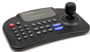
VS-TKC-100 PTZ Keyboard Controller